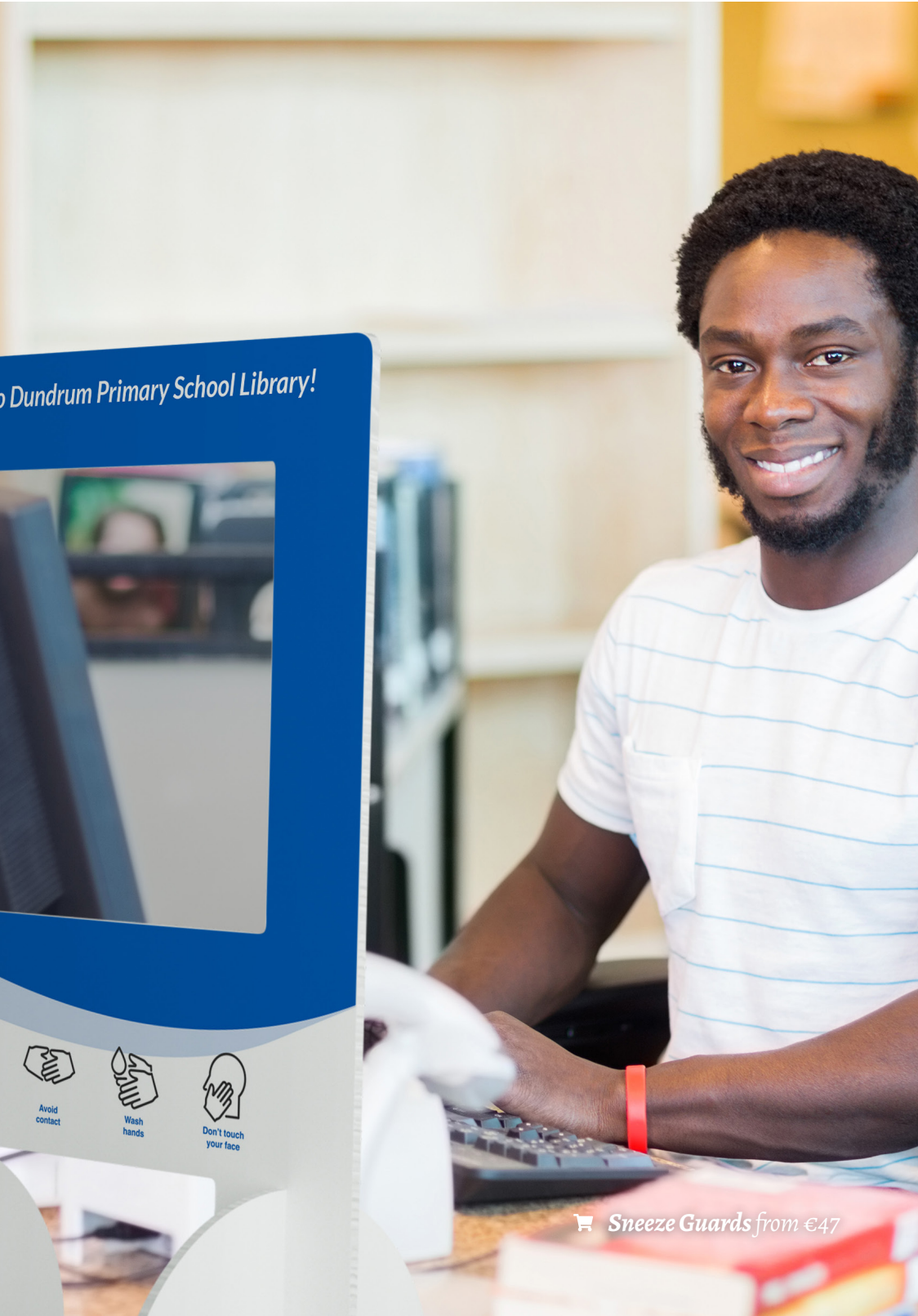
🛒 Sneeze Guards from €47