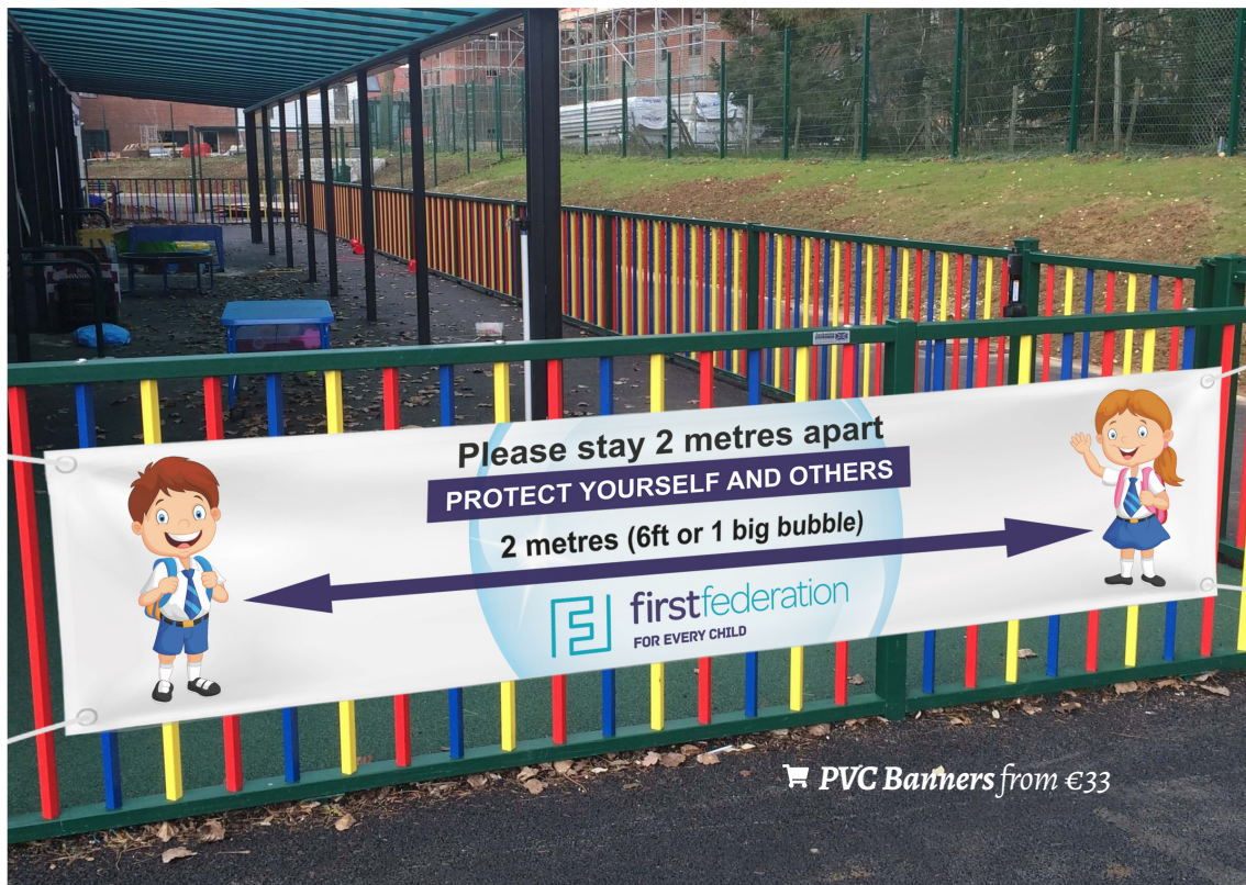
🛒 PVC Barriers from €33