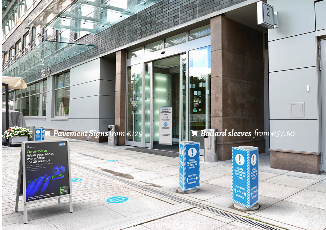
🛒 Pavement Signs from €129